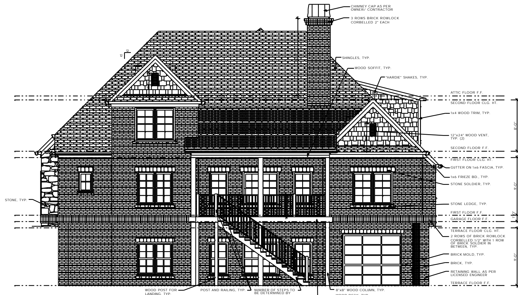
1 REAR ELEVATION 6 SCALE: 1/4" = 1'-0"