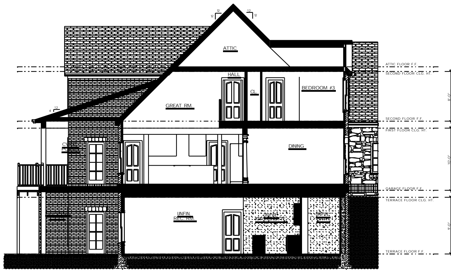
2 BUILDING SECTION SCALE: 1/4" = 1'-0"